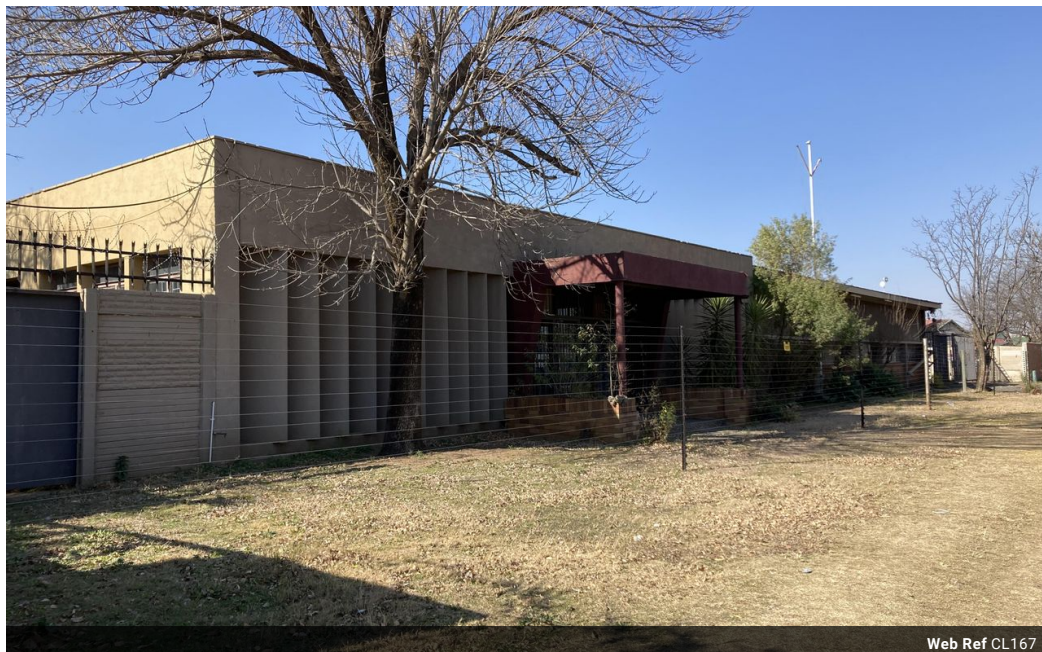
Web Ref CL167

101 on Olympus PHG Group Office Suites 101 Olympus Drive Helicon Heights Bloemfontein 9300